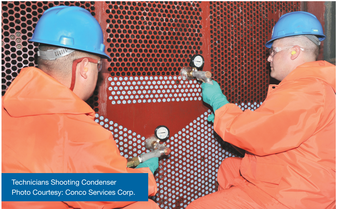
Technicians Shooting Condenser

Compared to other cleaning methods, mechanical cleaning minimizes unit downtime during the cleaning process because a typical team of technicians can clean 5,000 tubes