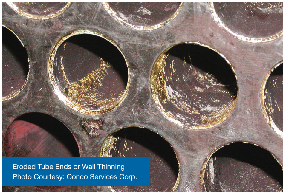
Eroded Tube Ends or Wall Thinning

"The contaminants that build up and damage condenser tubes over time run the gamut from soft and sticky to extremely hard."