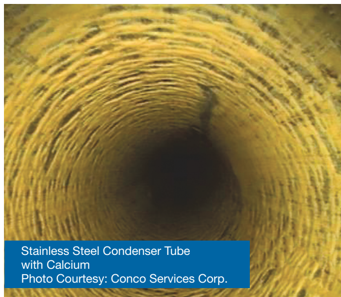
Stainless Steel Condenser Tube with Calcium

ance is impaired. Increased turbine back pressure, increased unit heat rate, increased losses to cooling water, increased CO 2 , and increased NOX emissions can lead to dramatic losses in unit output, unit availability and, undeniably, revenue.