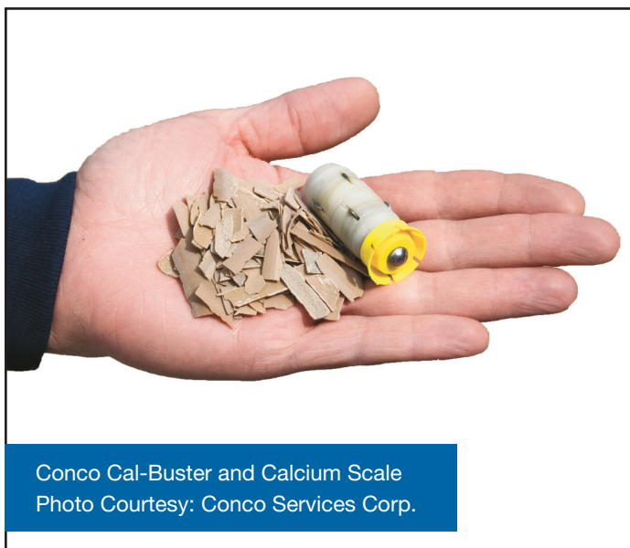
Conco Cal-Buster and Calcium Scale