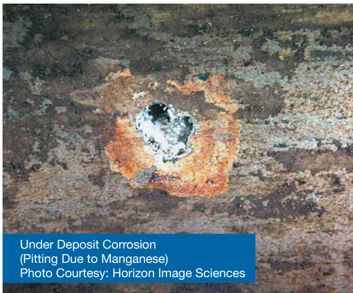
Under Deposit Corrosion (Pitting Due to Manganese)

Copper is a natural antimicrobial material, and while copper condenser tubes disrupt the growth of some microbes, they are also prone to the formation of a hair-like oxide deposition that will disrupt heat transfer if left unattended. Stainless steel tubes are prevalent in midwestern U.S. power